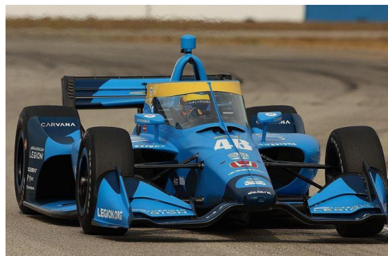
Jimmy Johnson driving American Legion sponsored IndyCar

The American Legion will be the primary sponsor on Johnson's No. 48 in one of the two races of the July doubleheader at Iowa Speedway. Johnson will be actively involved in The American Legion as a spokesman for the entire season. The Legion will also be the major sponsor for Brazilian driver Tony Kanaan's car in the 106th Indianapolis 500 on Sunday May 29th. Driver introductions start at 11:45 ET.