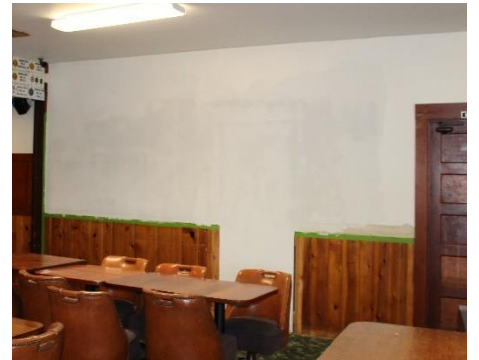
L to R Blocking up old pass-through window and old abandoned door to prep area for new cabinets and counter top