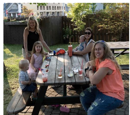
Moms Watching Future Members