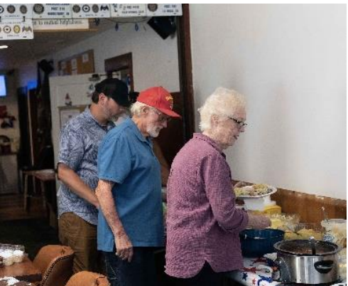
Dishing the Great Food