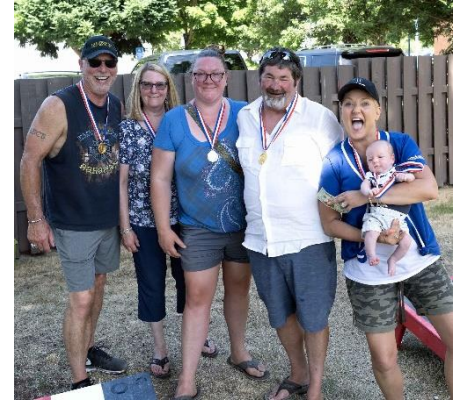
Happy Bean Bag Toss Winners