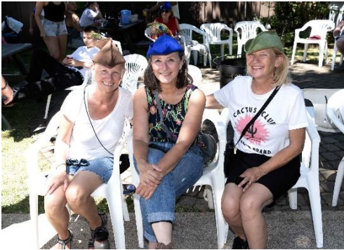
Ladies Enjoying the Sunshine