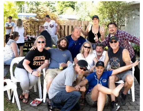
Friends Having a Good Time