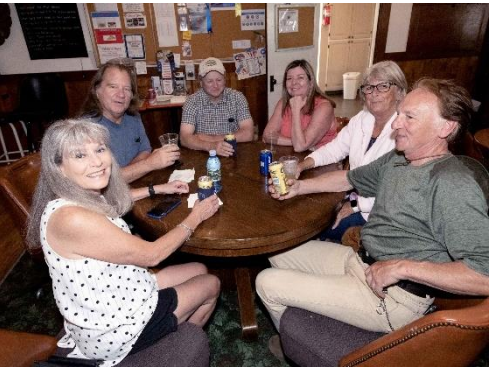
Friends Having a Good Time