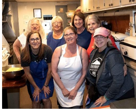
The Cruisin' Breakfast Team