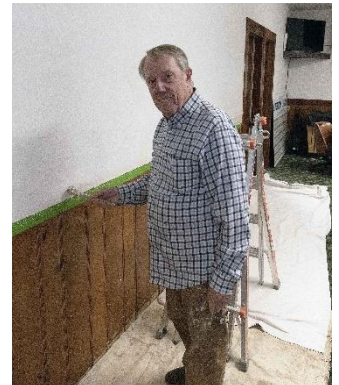
Phil Morton - Painting