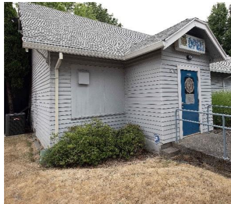
L-R: Old Boarded Up Window Replaced with New Siding – Ready for Painting