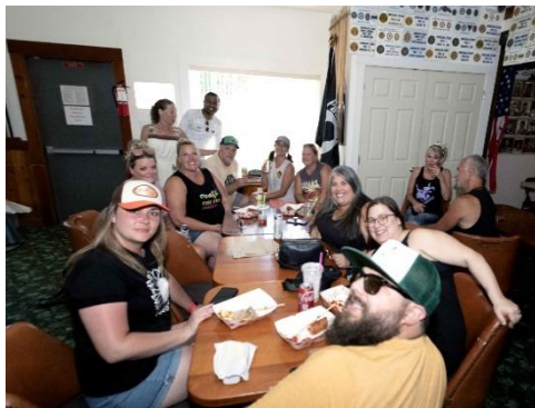
Friends Having a Good Time