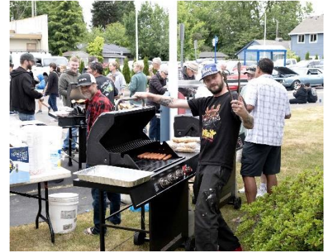
SAL Team Cooking Hot Dogs