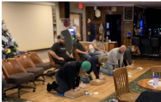
Members Learning CPR

A CPR/AED training class was presented at the Post by CPR Lifeline of Portland on Saturday December 2nd. Nine members attended this important class. We host this class every two years and we hope you consider attending the next one. You may need to save a life someday.