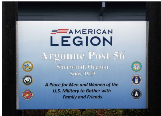
New Front Yard Sign