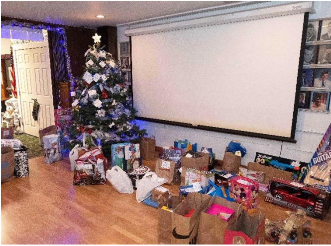
The Giving Tree with lots of donated toys and other gifts for Veteran's families